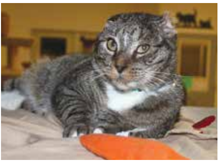
Boris, December Cat of the Month

December 5th from 11a.m. to 3p.m. at BCC Feline Rescue and Adoption Center, 2037 Foxon Road, North Branford. Second Annual Gift Card Fundraiser in January. Unwanted holiday gift cards can be dropped off any Saturday during the month of January at BCC Feline Rescue and Adoption Center, 2037 Foxon Road, North Branford. Fifth Anniversary Party and Winter Food & Supply Drive on Saturday, February 27 at BCC Feline Rescue and Adoption Center, 2037 Foxon Road, North Branford. Refreshments will be served.